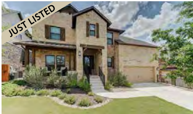
18713 Laramie Well CV $518,000

Unique Listings. Exclusive Services. Exceptional Results.