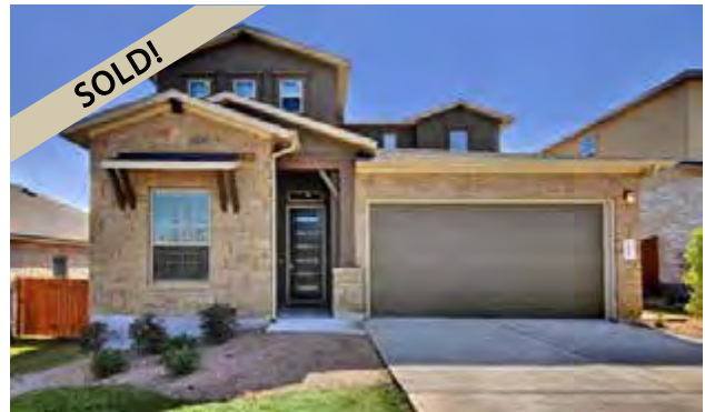
5817 Buchanan Draw