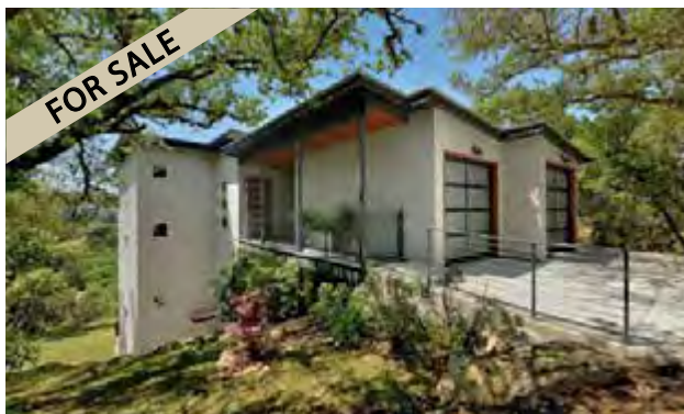
14207 Red Feather TRL $675,000

Curious what your home is worth? Call me for a free market analysis! (512) 897-4349