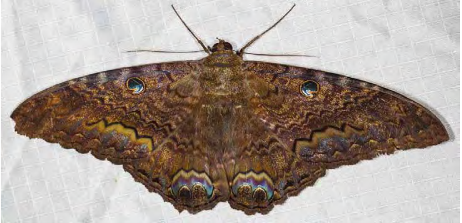
Photo: Black Witch

Commonly known as owlet moths, cutworms, or armyworms, moths in the Noctuidae family make up one of the largest families of Lepidoptera. The word Noctuidae is derived from the Latin word noctua meaning ‘little owl’ and the largest moth in this family in the continental United States is the Black Witch ( Ascalapha odorata ).