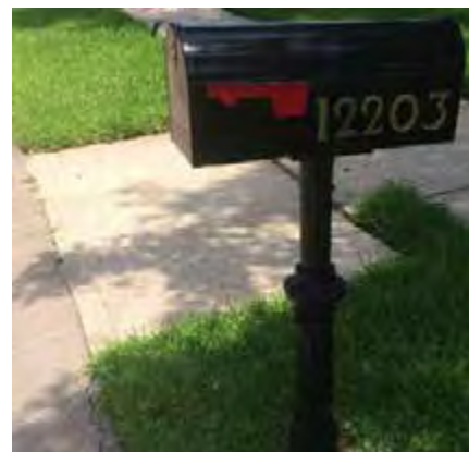
Here's another example of an attractive restored mailbox.