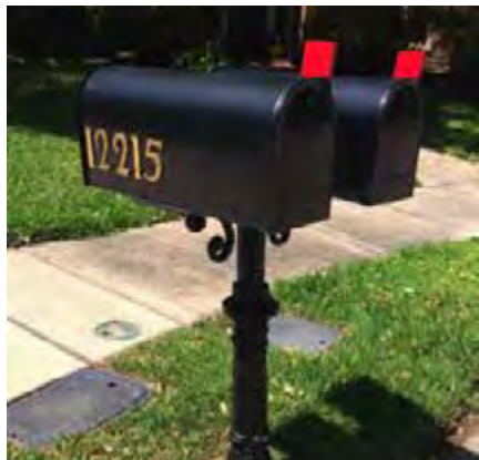
This is a good example of an attractive restored mailbox.

We thank you in advance for your support and active participation.