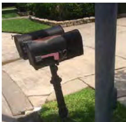
Here's an example with serious deficiencies that can be fully restored in about 2 hours by straightening/painting the post and adding two new mailboxes.