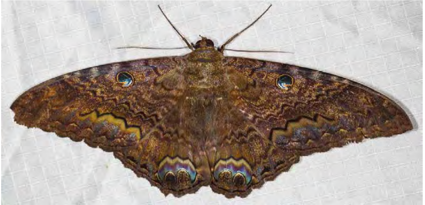
Photo: Black Witch

Commonly known as owlet moths, cutworms, or armyworms, moths in the Noctuidae family make up one of the largest families of Lepidoptera. The word Noctuidae is derived from the Latin word noctua meaning 'little owl' and the largest moth in this family in the continental United States is the Black Witch ( Ascalapha odorata ).