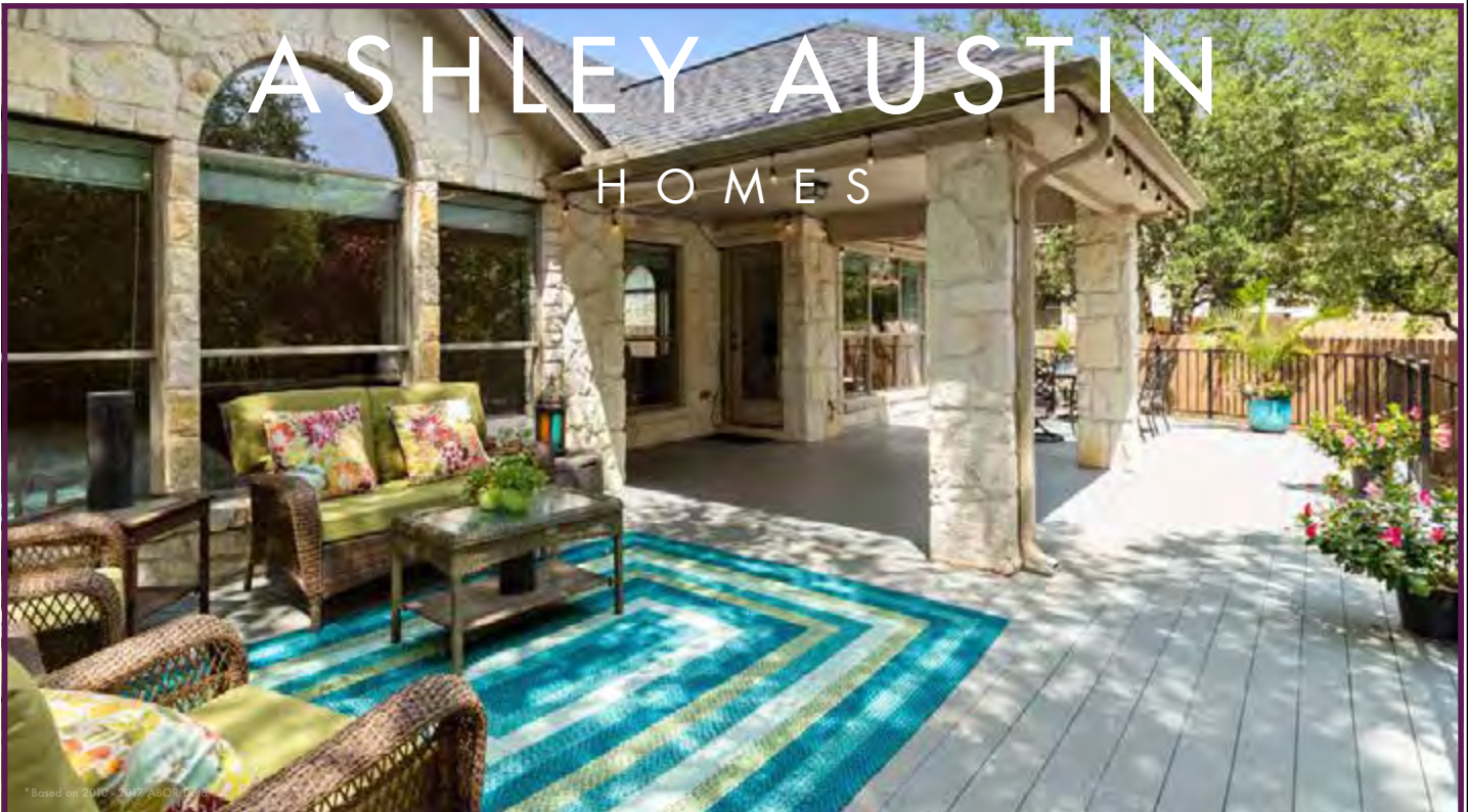
*Based on 2010-2017 ASOR Data