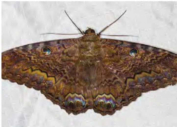
Photo: Black Witch

Commonly known as owlet moths, cutworms, or armyworms, moths in the Noctuidae family make up one of the largest families of Lepidoptera. The word Noctuidae is derived from the Latin word noctua meaning 'little owl' and the largest moth in this family in the continental United States is the Black Witch ( Ascalapha odorata ).