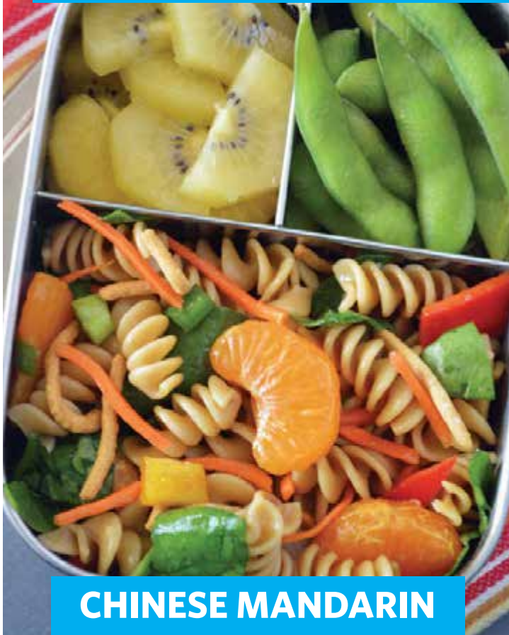
CHINESE MANDARIN PASTA SALAD