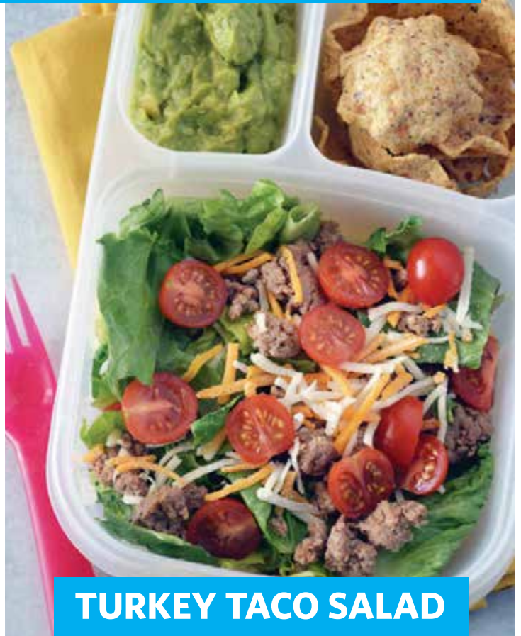
TURKEY TACO SALAD BENTO BOX

Place in lunchbox with kiwi and edamame.