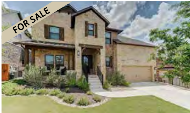
18713 Laramie Well CV $508,000

Unique Listings. Exclusive Services. Exceptional Results.