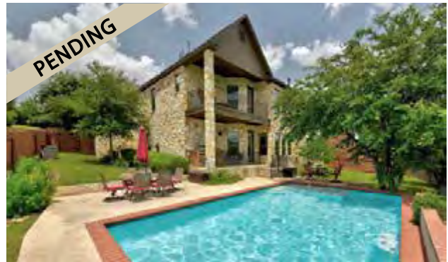
5601 Lipan Apache Bend Multiple offers in 1 week!