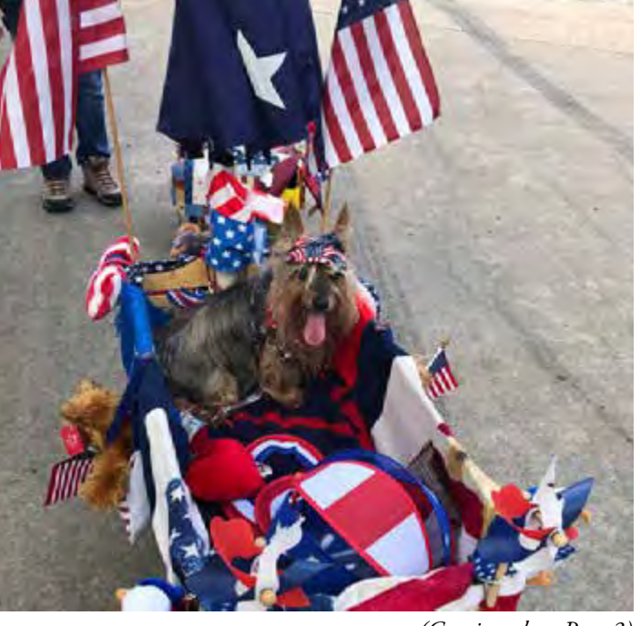
(Continued on Page 3)