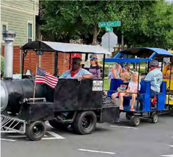
MNA July 4th Parade Kiddie Express Train, Photo by D. Updegrave