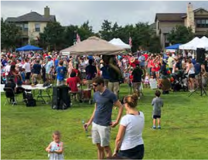
MNA July 4th Festival at Ella Wooten Park