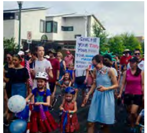
July 4th Parade Procession