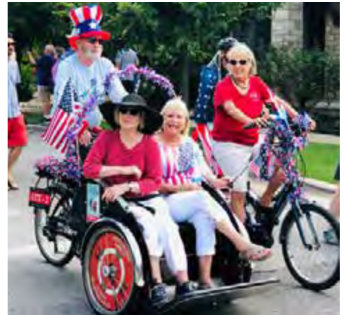
Cycling the Parade Route