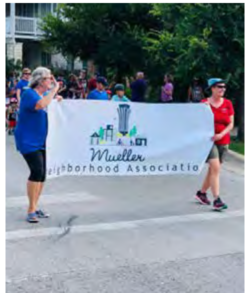
MNA Banner Kicking Off the Parade