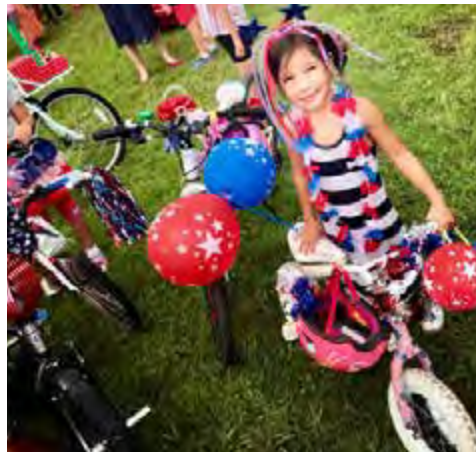
First Place Winner in the Decorated Bike Contest, Photo by Woody Lauland