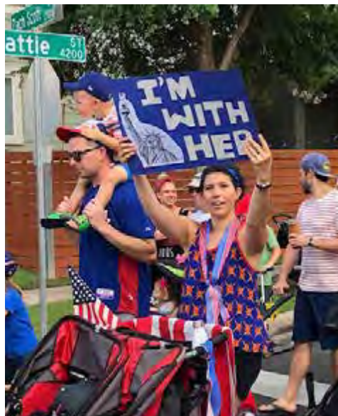
Let Freedom Ring