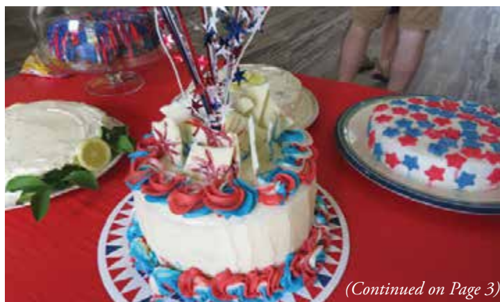
(Continued on Page 3)