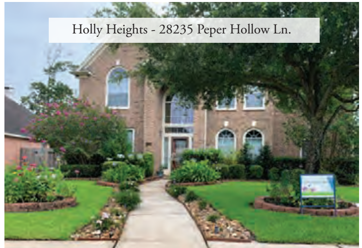
Holly Heights - 28235 Peper Hollow Ln.

Congratulations to the June 2019 Yard of the Month winners: