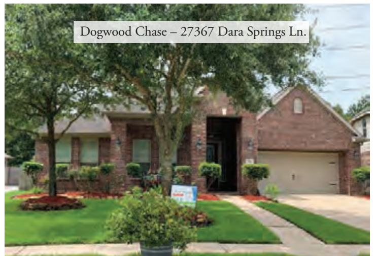
Dogwood Chase – 27367 Dara Springs Ln.