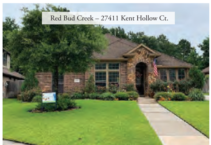
Red Bud Creek – 27411 Kent Hollow Ct.

And thank you to Inframark for sponsoring 3 Yard of the Month winners for May, June, July and August.