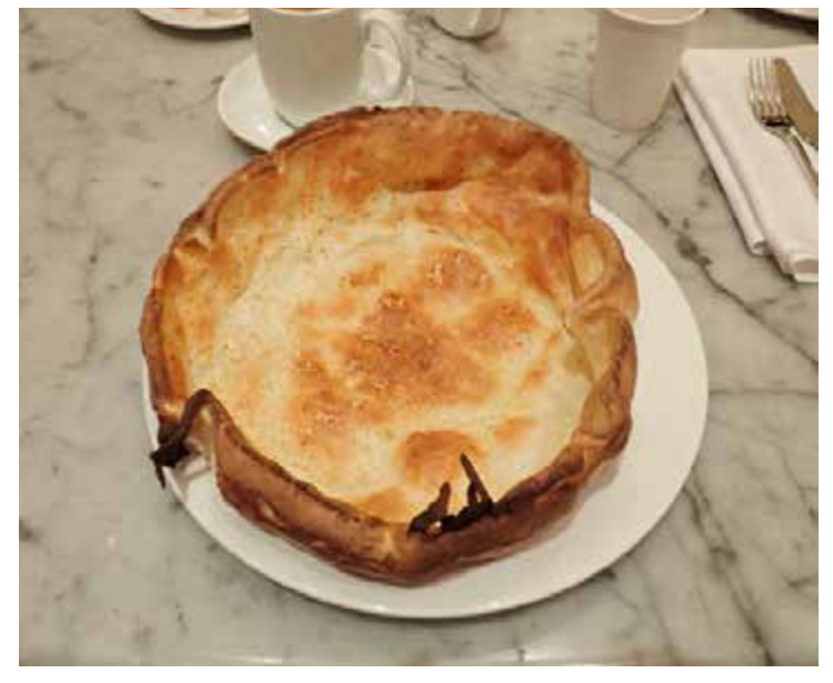
14 Summerwood Life - August 2019

Would you like to share a specific recipe? Your neighbors would love to read about it! Email me at tifflivelytx@gmail.com. If I don't, my Cordon Bleu trained stepmother will!