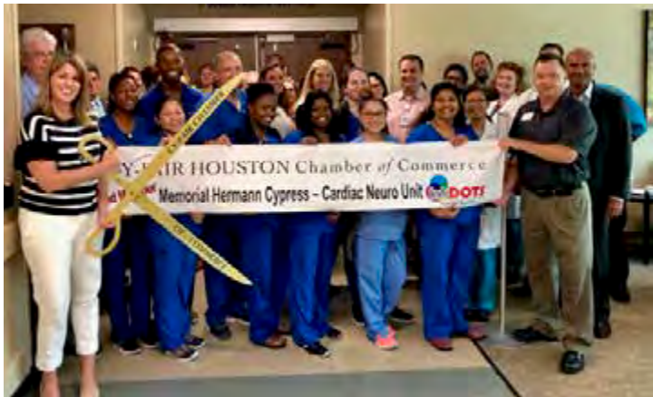
Memorial Hermann Cypress Hospital employees celebrate the opening of the hospital's expansion with a ceremonial ribbon cutting.

Learn more about the full range of services offered at Memorial Hermann Cypress and its connection to Memorial Hermann’s fully integrated, comprehensive care network.