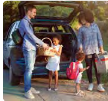
(family picnic)

If financial constraints are keeping you from exploring the world, it may be time to reassess your approach to travel. From road trips across the country to jaunts across your state, there are plenty of ways to curb costs, so your biggest challenge is finding more days away from the office, not replenishing your bank account.