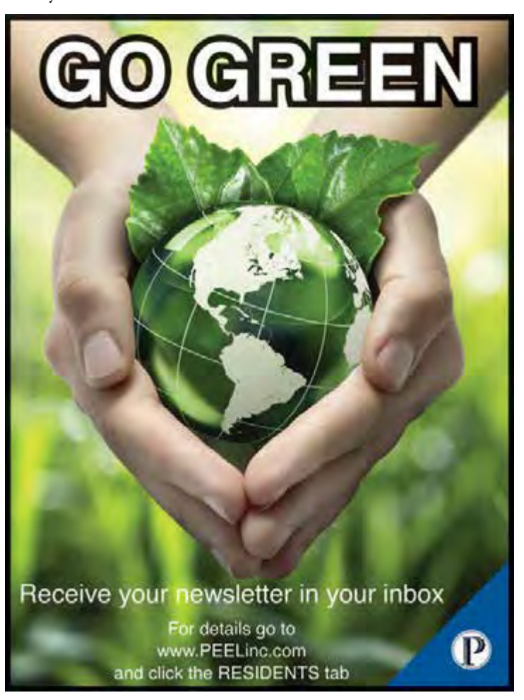
Fair Oaks Gazette - September 2019 5