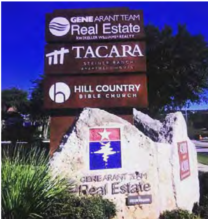
New building signage