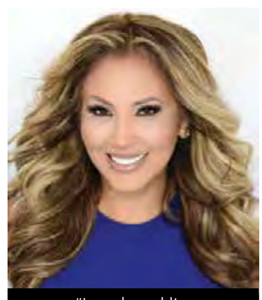
"I work and live in Summerwood!"