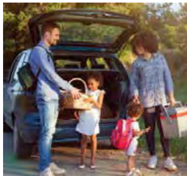
(family picnic)

If financial constraints are keeping you from exploring the world, it may be time to reassess your approach to travel. From road trips across the country to jaunts across your state, there are plenty of ways to curb costs, so your biggest challenge is finding more days away from the office, not replenishing your bank account.