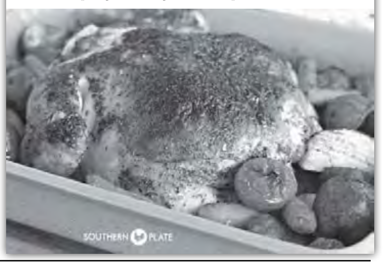
6 The Lakeshore Report - October 2019

Low Carb Note: Make this low carb by subbing low carb veggies for the carrots and potatoes. Suggestions are: cauliflower, broccoli, asparagus, cabbage, brussels sprouts, etc.