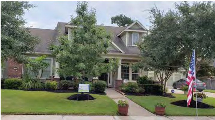
27255 Monique Ridge - Whispering Oaks