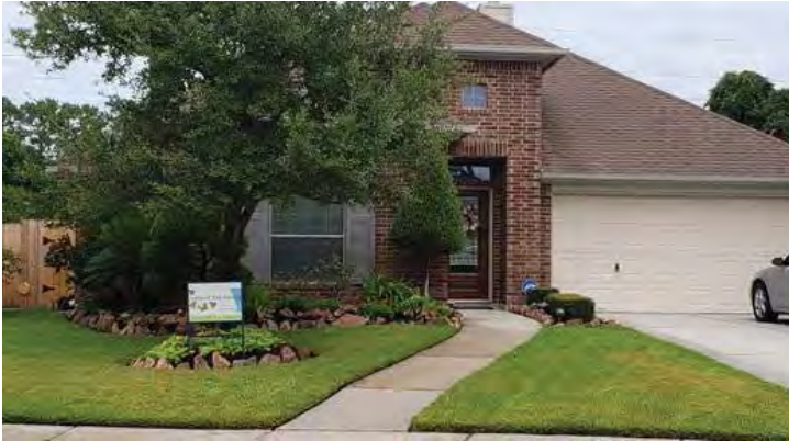
1807 Ryansbrook Ln. - Maple Glen