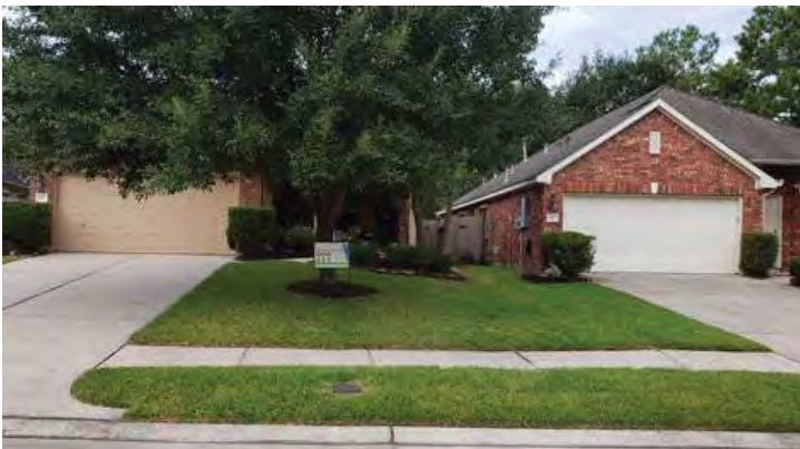
28211 Kings Cove - Maple Glen

And thank you to Inframark for sponsoring 3 Yard of the Month winners for May, June, July and August.