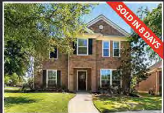
28510 Chateau Springs