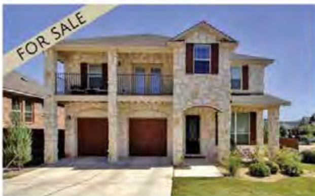
18500 Tanner Bayou Loop $432,000

Do you know someone who would love to live in Sweetwater? Call me to learn more about these 3 great homes! (512) 897-4349