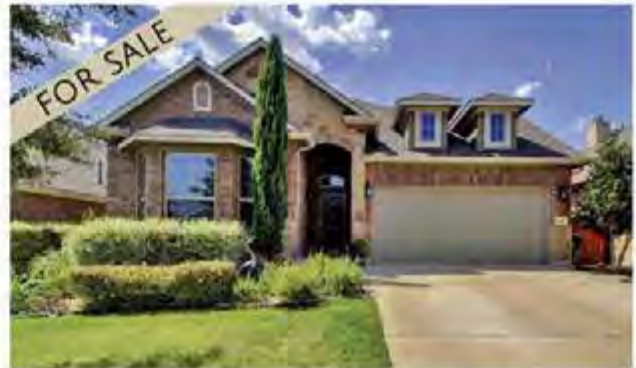
5921 Gunnison Turn RD $435,000