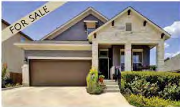
5212 Inks Clearing LN $415,000