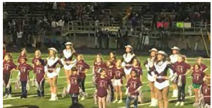
Austin High Red Jackets on the field in 2018 with Fall Clinic Campers.