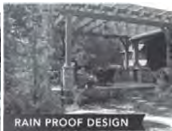
RAIN PROOF DESIGN