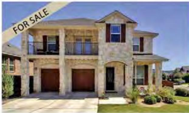
18500 Tanner Bayou Loop $432,000

Unique Listings. Exclusive Services. Exceptional Results.