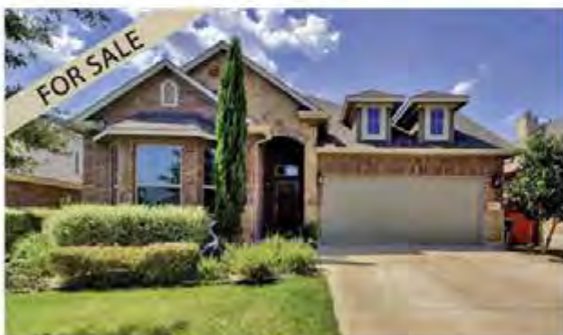
5921 Gunnison Turn RD $435,000

Curious what your home is worth? Call me for a free market analysis! (512) 897-4349