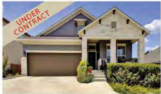
5212 Inks Clearing LN $415,000