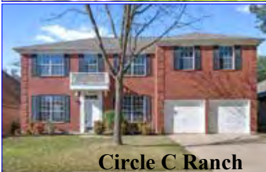
Circle C Ranch

6438 Old Harbor Lane John's new listing is "SOLD" . This listing was retained from another brokerage after they had it listed for 121 days on the market. John listed the home and sold it in 7 days for full price. Nice 5 bedroom, 3.5 bath close to Kiker. $479,000 .