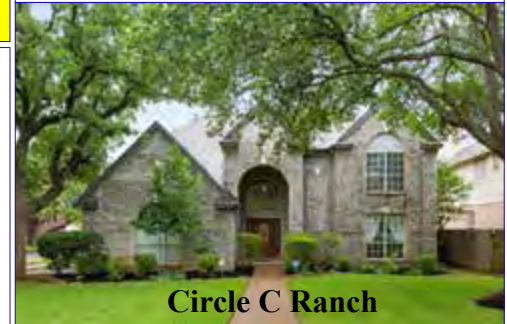
Circle C Ranch