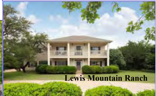
Lewis Mountain Ranch