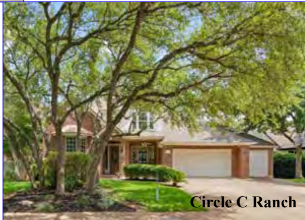
Circle C Ranch