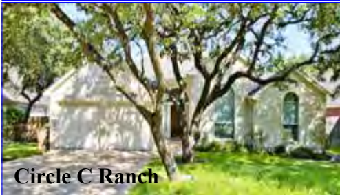
Circle C Ranch

Call John's sell phone at 512 970-1970 anytime.