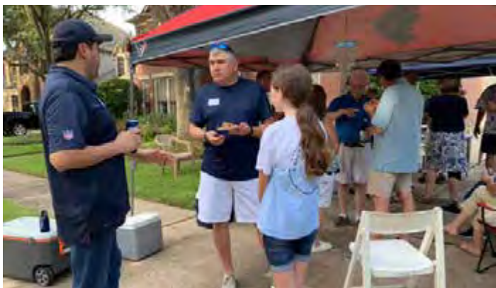
Auburn Shores 2019