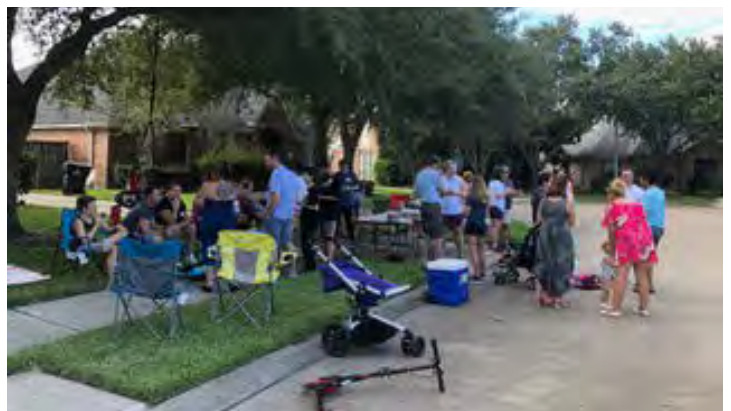
Indigo Falls 2019