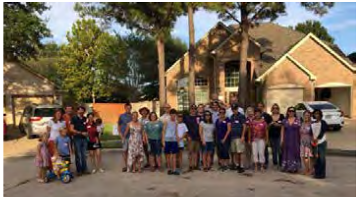
Eden Springs 2019