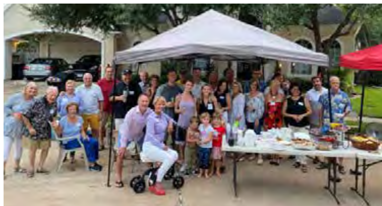
Crescent Bay 2019