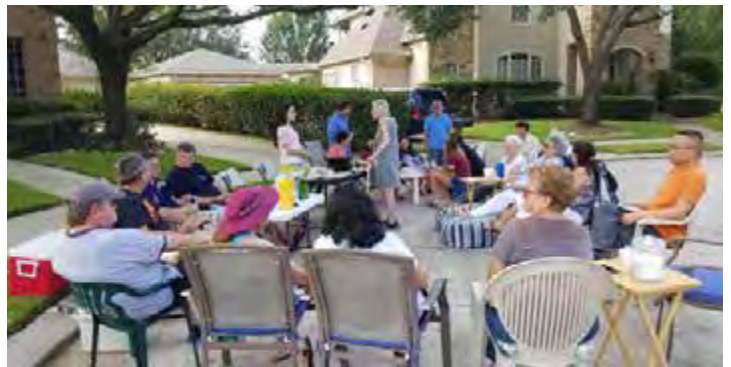
Crystal Falls 2019