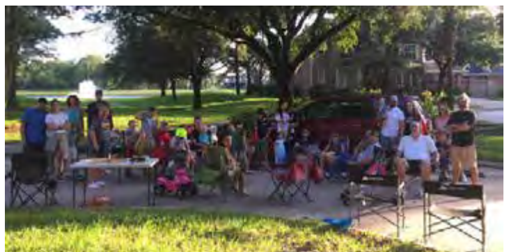
Pebble Way 2019