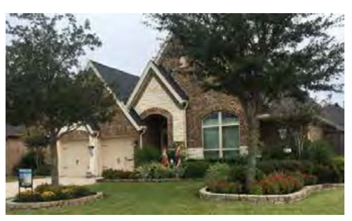
2023 Mariposa Edge