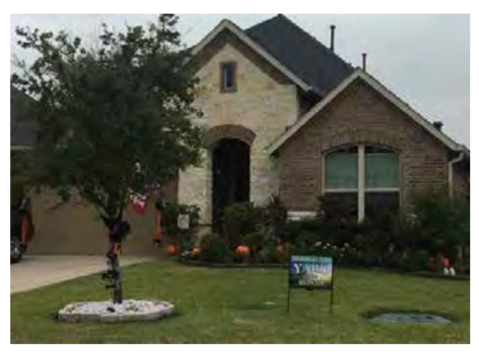
2023 Mariposa Edge

The winners each received a $25 gift card in appreciation of their hard work and dedication in keeping RPW beautiful.