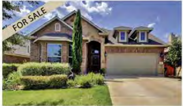
5921 Gunnison Turn RD $435,000