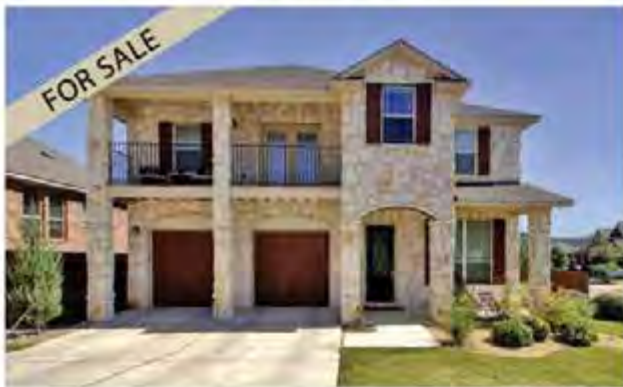
18500 Tanner Bayou Loop $432,000

Are you thinking of selling your Sweetwater home?