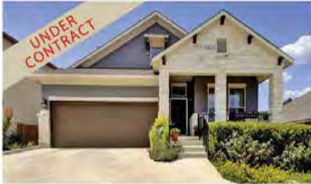
5212 Inks Clearing LN $415,000