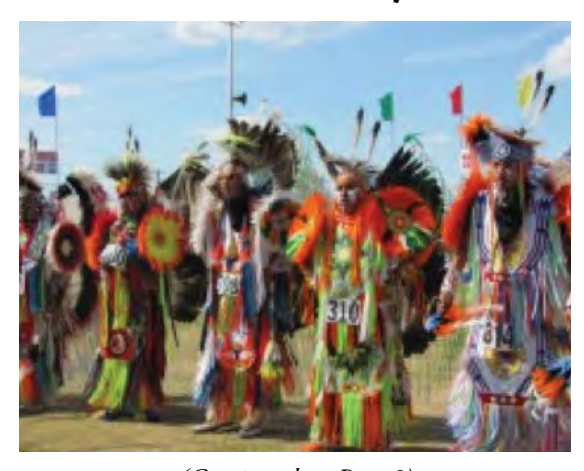
(Continued on Page 3)