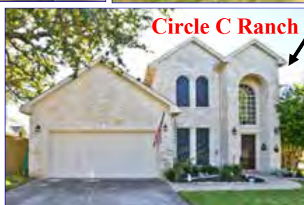
Circle C Ranch