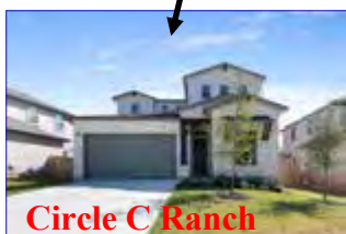
Circle C Ranch

7017 Kalahari Drive in Avana is "Just Listed!" Brand new home, never lived in. 4 bedrooms, 3 full baths. Quartz counters throughout kitchen and baths, "wood tile" throughout much of home. Big game room and open family room with surround sound! Covered patio with house gas is ready for parties! Offered at $575,000.