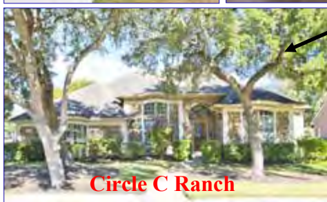
Circle C Ranch