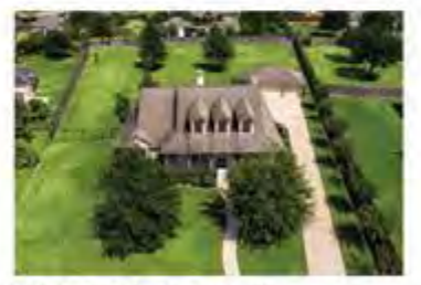
17110 CALICO PEAK WAY | $450,000 4 bedrooms / 2 full baths / 3 car detatched garage Pended in 6 DAYS!