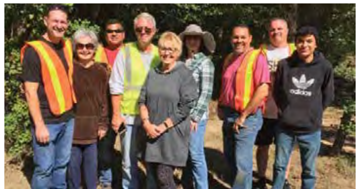
Seed stomp November 2nd at future bluebonnet/wildflower garden across the street from Cypress Park.