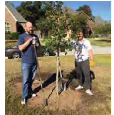
53 Texas-native trees were planted November 9th at Hawthorn Trails entrance, Redbud Creek Pond and the Tot Lot behind Mulberry Park.