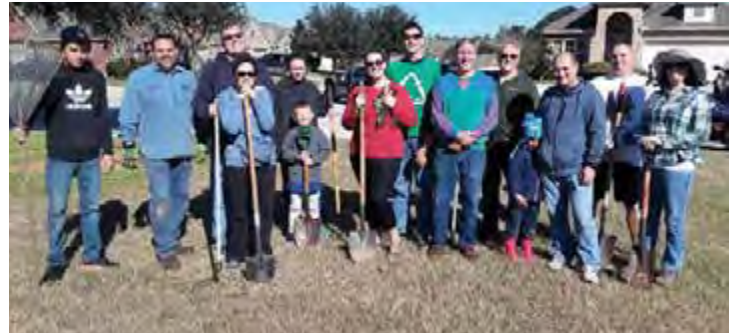
Sixteen crape myrtles planted at Rebecca Fields Ln. on November 2nd.

Another successful reforestation effort was completed in November thanks to the efforts of the Beautification Committee, resident volunteers, and Trees for Houston.