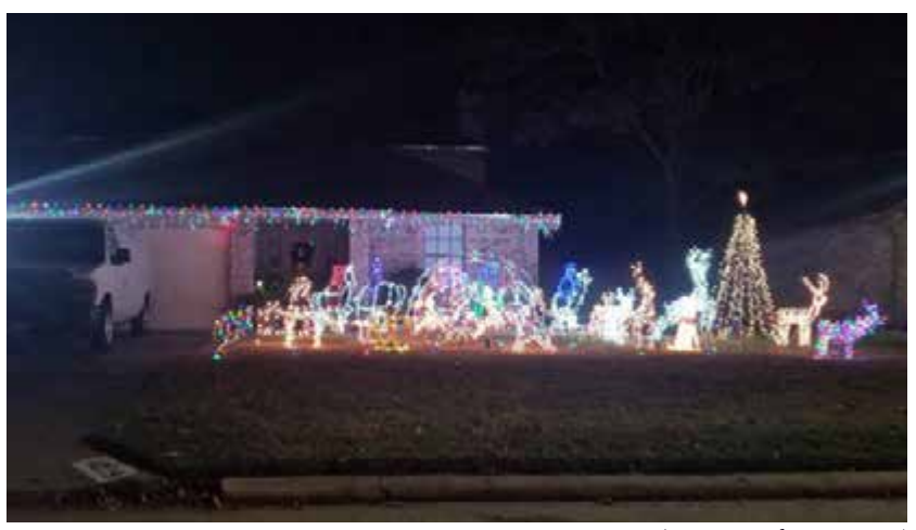
(Continued on Page 3)