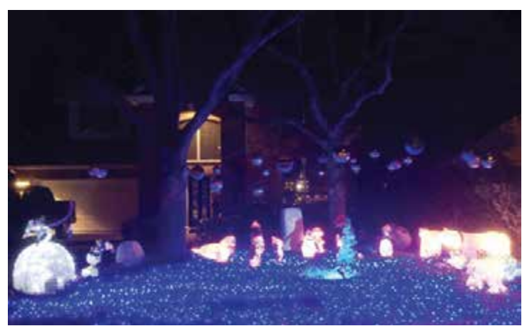
(Continued on Page 5)