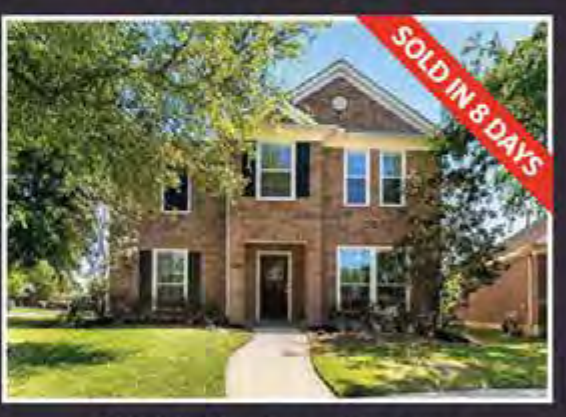
28510 Chateau Springs