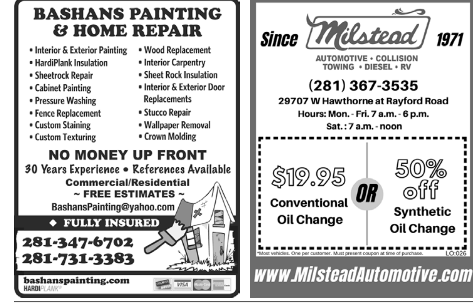
4 Spring Trails - January 2020

Residents are encouraged to report unsafe or illegal use of motorized recreational vehicles within the community to the Montgomery County Sheriff's Office, non-emergency number.