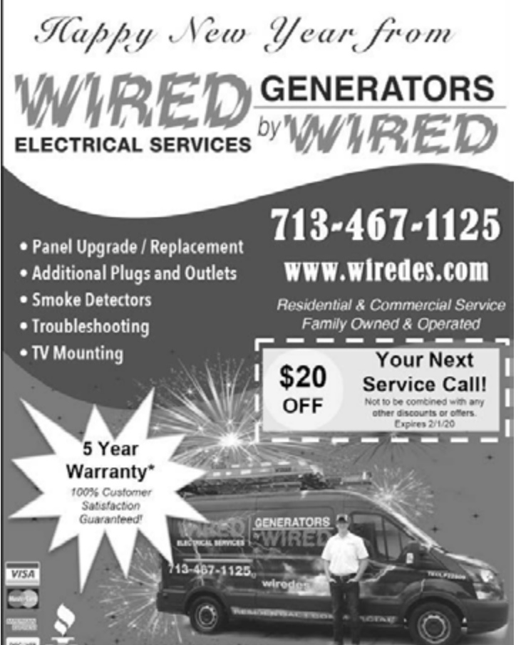
BBB Master #100394 TECL # 22809

Visit the Spring Trails Website, Calendar for event times and venues.