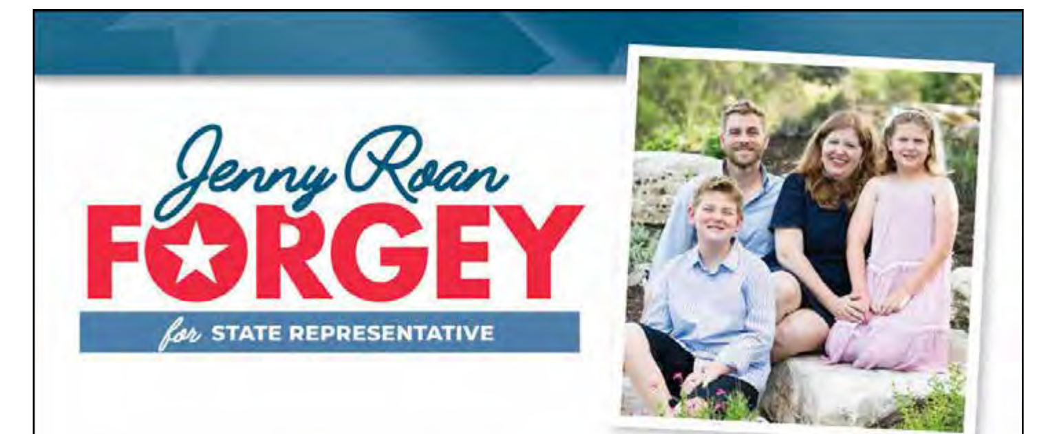
Erica Woodford Photography