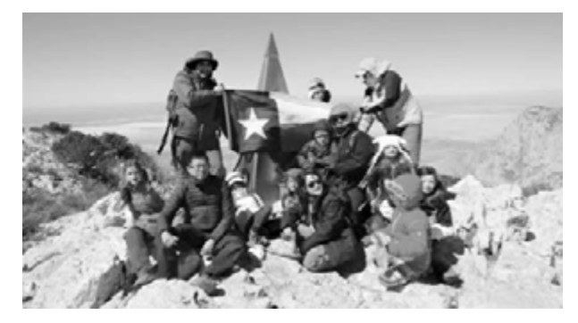
Briarhills residents on top of the highest summit in Texas at Guadalupe Peak, Spring Break Expedition 2019

Join us! Big Bend and West Texas Spring Break Expedition Details at: https://www.oakgeosciences.com/spring-break-exp