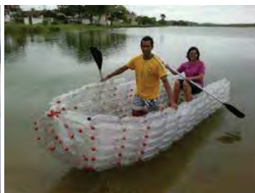
NEED A NEW BOAT?