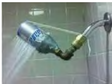
SHOWER HEAD NEED REPLACING?

Recycling can be confusing and frustrating but it can also be hilarious and give us all a good laugh. Some people have really used their imaginations to take recycling to a wonderful “laugh producing” level.