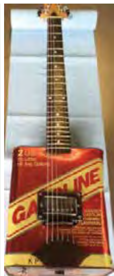
GAS CAN GUITAR HOPE THE MUSIC ISN'T TOO HOT!

Over the past four years of writing Lettuce Recycle, I have gotten some wonderful questions. I welcome these questions and always learn something new from each of them. Below is a “cheat sheet” for recycling. It doesn’t address all recycling questions but it helps provide a basic understanding of what can and cannot go into the blue curbside bin. I hope this helps.