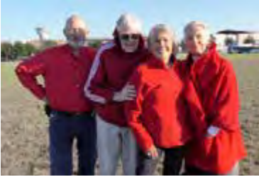
The four core team of WAAO Inc.

For several years, the Mueller resident-based team We Are All ONE Inc. (WAAO) has envisioned the addition of a unique urban village to the neighborhood, conceptualizing it constructed on the eight acres at 51st, Berkman, Barbara Jordan, and Aldrich Streets. On January 25th, over 75 people gathered to become acquainted with this vision as the WAAO Inc. team and several architecture students presented ideas and architectural renderings for this innovative urban village, imaginatively dubbed ONEderment Central.