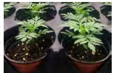
Marigolds growing in the Greenhouse. Should be blooming in a few weeks!