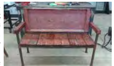
Sample of a unique upcycled project by the Ag Mech class that combines metal and wood.