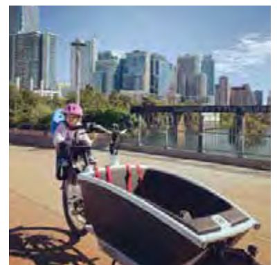
Talia Rudow enjoys outings on the family cargo bike.