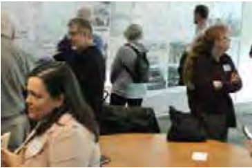
The students received strong feedback on their work

For several years, the Mueller resident-based team We Are All ONE Inc. (WAAO) has envisioned the addition of a unique urban village to the neighborhood, conceptualizing it constructed on the eight acres at 51st, Berkman, Barbara Jordan, and Aldrich Streets. On January 25th, over 75 people gathered to become acquainted with this vision as the WAAO Inc. team and several architecture students presented ideas and architectural renderings for this innovative urban village, imaginatively dubbed ONEderment Central.