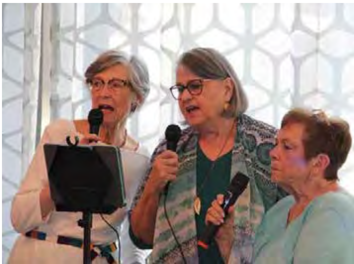
Overture Mueller residents give it their all at Karaoke Night at one of their weekly Mix & Mingle Happy Hours.

For more information about Mueller Overture, call 512-643-5555 or visit www.overturemueller.com .