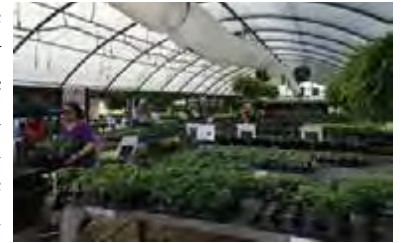
Plant sale 2019. Many options to choose from!

Community Involvement: Local businesses in and around the Mueller area have been a huge part of the success of the Clifton programs. Some of our partners have included L'Oca D'Oro, Doubletree Hotel, Tillery St. Plant Company, Eden East Farm, Childcraft School, Child Inc, Copernicus Academy, and Westminster Nursing Home. Clifton is always looking to expand its community partners. If you would like more information on providing an internship or post-school job placement, please contact the school at (512) 414-3614.