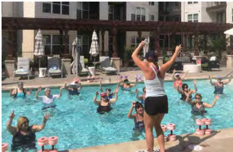
Residents at Overture enthusiastically engage in Water Aerobics three times a week during the warm weather.

Overture is a bustling, eclectic community of men and