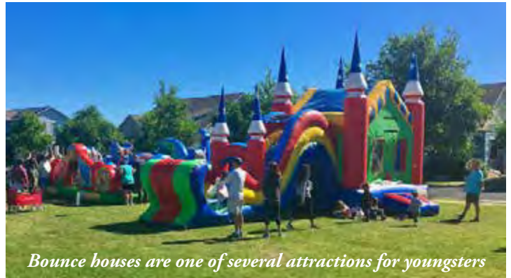
Bounce houses are one of several attractions for youngsters

Save the Date: Saturday, April 11, 2020 9 - 11 am at Ella Wooten Park