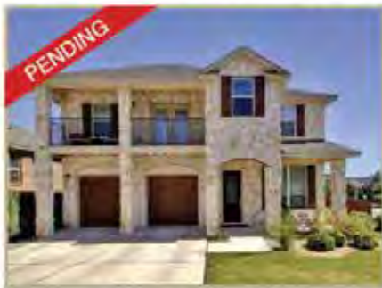
18500 TANNER BAYOU LOOP MULTIPLE OFFERS!

Low interest rates and low inventory have created a huge demand for homes in the Lake Travis area! If you are thinking of selling, call us now to get your home sold!