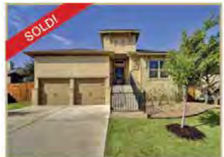
5300 BUCHANAN DRAW MULTIPLE OFFERS!