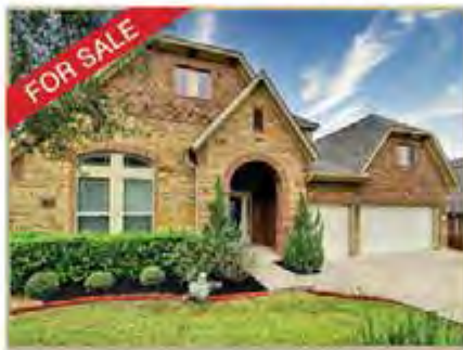
5608 CHEROKEE DRAW RD $549,000