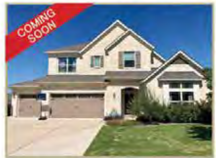
6104 Gunnison Turn Rd