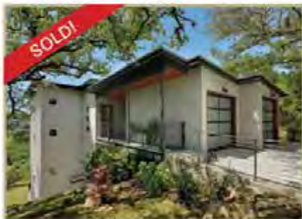
14207 RED FEATHER TRL