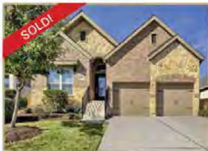
5208 INKS CLEARING UNDER CONTRACT IN 1 DAY!