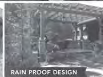
RAIN PROOF DESIGN