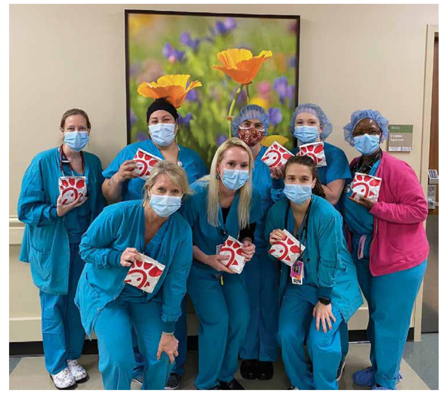
CHICK-FIL-A, TOWNE LAKE, TOOK 287 SANDWICHES IN THE MORNING AND 87 SANDWICHES IN THE EVENING TO MEMORIAL HERMANN HOSPITAL ON APRIL 6TH TO THANK THE STAFF FOR ALL THEY ARE DOING TO KEEP US SAFE.

Copyright © 2020 Peel, Inc. Cypress Mill Chronicle - May 2020 1