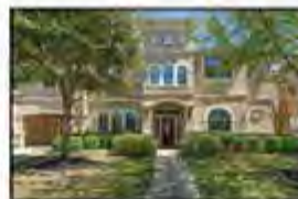
16714 S Swirling Cloud Court 4/3.5/3, 4320 SqFt, $450,000