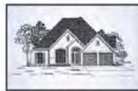
Call for our list of Coming Soon Homes!