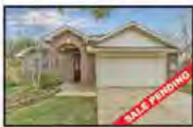
21939 Whispering Daisy Ct 4/2/2, 2234 SqFt, $249,500