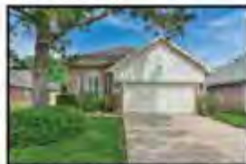
20322 Fairfield Park Way 3/2/2, 1755 SqFt, $225,000