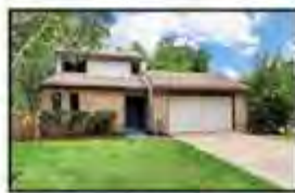
14527 Moss Creek Lane 3/2.1/2, 2395 SqFt, $255,000