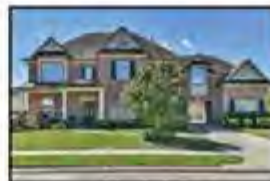
21939 Twisted Leaf Drive 5/3.1/3+, 4371 SqFt, $440,000