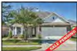
15311 Hazen Point Drive 3/2.1/2, 2515 SqFt, $260,000