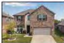
15730 Summer Maple Trail 4/2.1/2, 3062 SqFt, $308,000