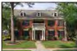
15602 Wildwood Run 4/3.1/2, 3261 SqFt, $329,000