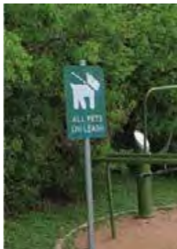
Quarry Area of Perry Park