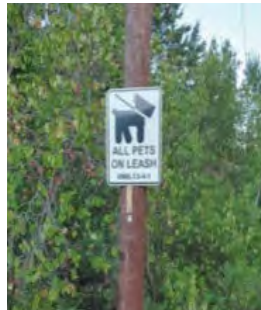
Upper Perry Park