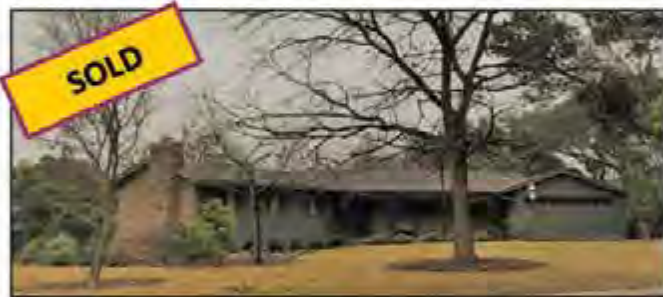
3315 Perry Lane