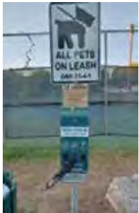
At the Tennis Courts of Perry Park

Please enjoy your walks responsibly with your dogs.