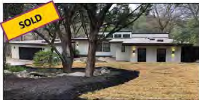
2729 Trail of Madrones