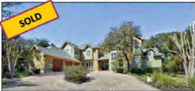
7228 Oak Shores Drive

We are practicing "no contact showings" as well as providing face masks, shoe covers, disposable gloves, Clorox wipes and hand sanitizer to ensure Sellers, Buyers and Realtors® remain safe and healthy. We also offer DocuSign for on-line signatures and FREE remote closings so no parties have to go into a title company. Contact me for more information about safely selling and buying properties during these crazy times.