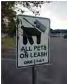
At the West Side Parking Lot of Highland Park Elementary School