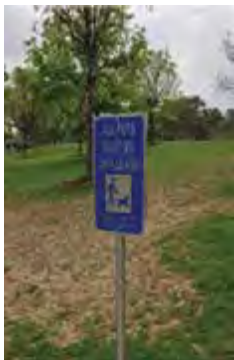
Trail intersection in Perry Park