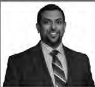
Second Generation Willowbridge Resident

Thinking of Buying or Selling? Contact Me Today!