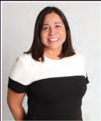
Area resident for 25 years.