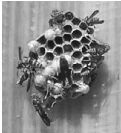
Paper wasps on paper nest.

2. A sighting and dead specimen was found in Washington state in December 2019 in Blaine,