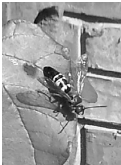
Cicada killer wasp on redbud.