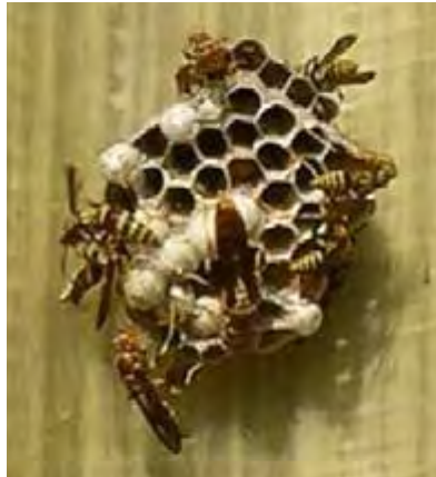
Paper wasps on paper nest.

This work is supported by Crops Protection and Pest Management Competitive Grants Program [grant no. 2017-70006-27188 /project accession no. 1013905] from the USDA National Institute of Food and Agriculture.