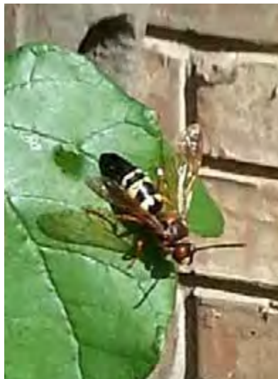
Cicada killer wasp on redbud.