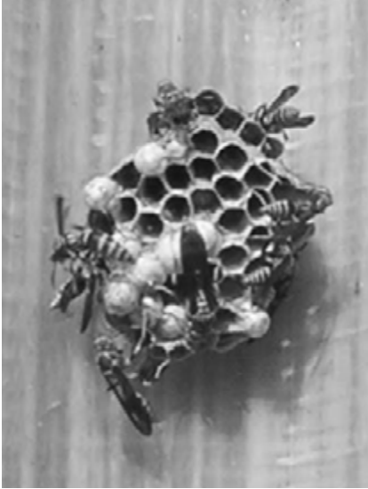
Paper wasps on paper nest.