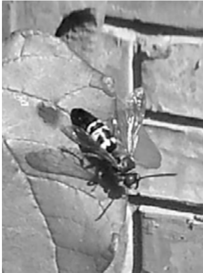
Cicada killer wasp on redbud.

What headline can draw people away from thoughts of the current state of the world and Coronavirus? That would be MURDER HORNETS! I cannot think of a more sensationalized headline, so kudos to whomever came up with that attention grabber. This headline is popping up everywhere from social media outlets, television, newspapers, and others. Quite frankly, it makes me cringe each time I see it. Asian giant hornets (AGH) are Vespa mandarinia NOT "murder" hornets. If you want to use a common name instead of the scientific name, then call them by the correct common name of Asian giant hornet.