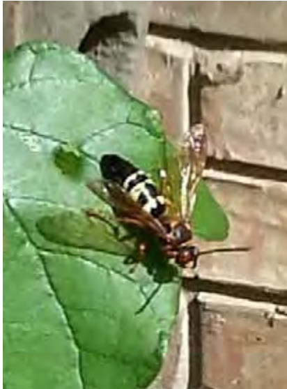
Cicada killer wasp on redbud.

What headline can draw people away from thoughts of the current state of the world and Coronavirus? That would be MURDER HORNETS! I cannot think of a more sensationalized headline, so kudos to whomever came up with that attention grabber. This headline is popping up everywhere from social media outlets, television, newspapers, and others. Quite frankly, it makes me cringe each time I see it. Asian giant hornets (AGH) are Vespa mandarinia NOT "murder" hornets. If you want to use a common name instead of the scientific name, then call them by the correct common name of Asian giant hornet.