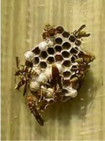
Paper wasps on paper nest.