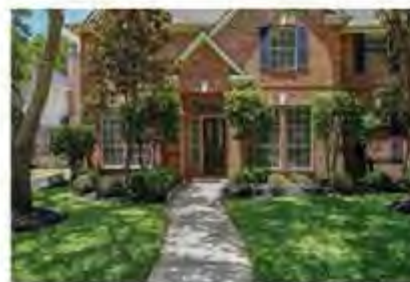
12170 Wilbury Park