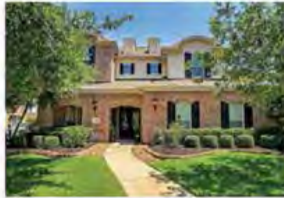
6002 Saratoga Springs