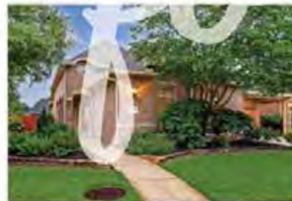
6507 Canyon Cliff