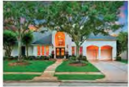
12211 Vista Bay