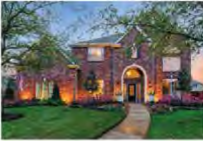
5903 Sandia Lake