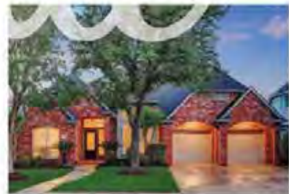
12007 Isle Vista