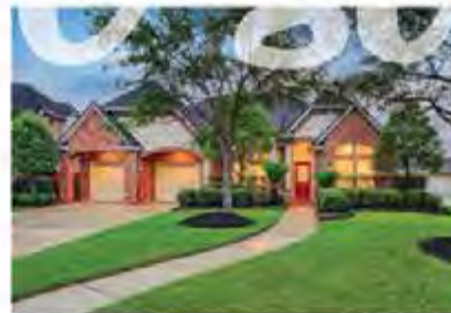
12107 Sonora Canyon