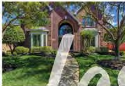
5702 Ballina Canyon