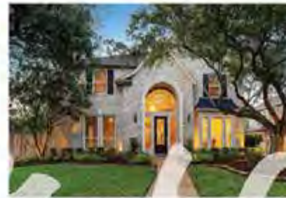
12130 Mill Stream