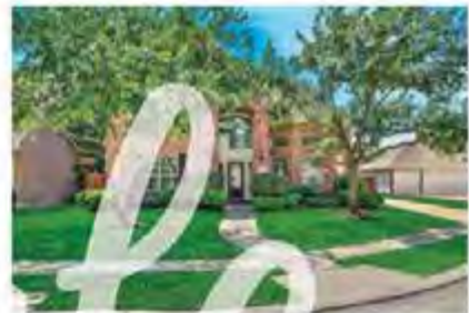
6115 Durango Bay