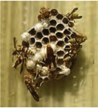
Paper wasps on paper nest.

Asian giant hornets are capable of inflicting a painful sting. Please note that while the sting can lead to death in some cases, it is not what typically happens. People are also capable of receiving painful stings from insects already here in Texas such as honey bees, paper wasps, yellowjackets, or even fire ants and some can die from being stung. Death by insect sting usually depends upon the number of stings and how your body chemistry reacts to venom injected by the insect. Asian giant hornets are capable of killing other insects, including honey bees and other pollinators, but they are not doing this to be vicious or killing for sport. The hornets use insects they kill as food for their larvae....just like other wasps that we have here in Texas.