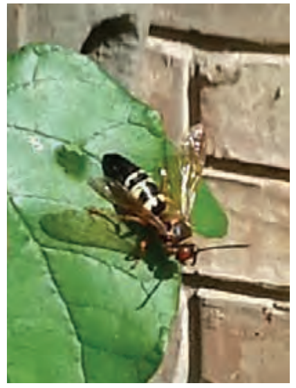
Cicada killer wasp on redbud.

you have these wasps, then please send samples or images to me for identification as Texas A&M AgriLife Extension Service are identifying any items