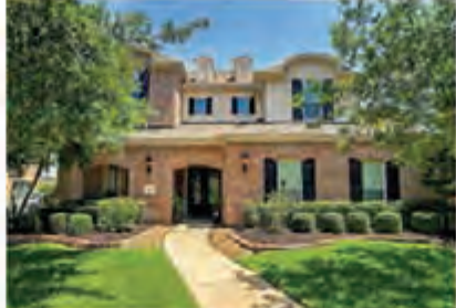
6002 Saratoga Springs