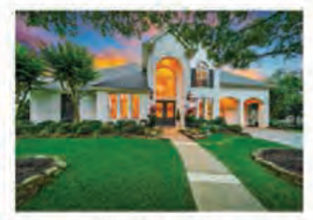
12211 Vista Bay