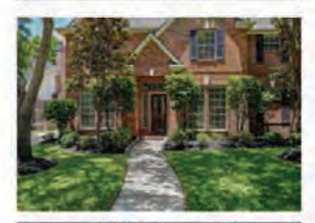
12170 Wilbury Park