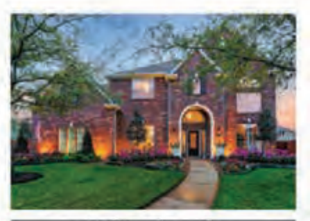
5903 Sandia Lake